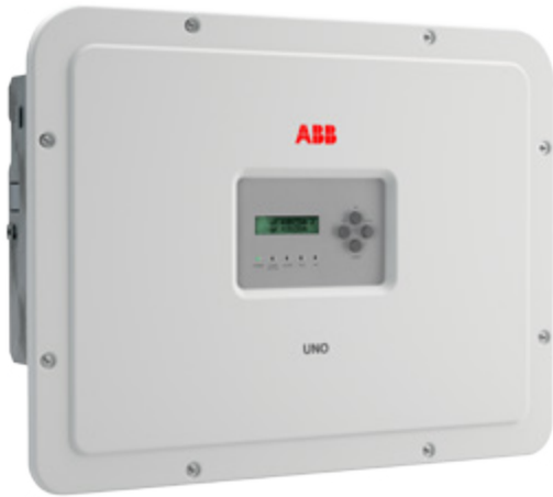
ABB string inverters UNO-DM-6.0-TL-PLUS 6 kW