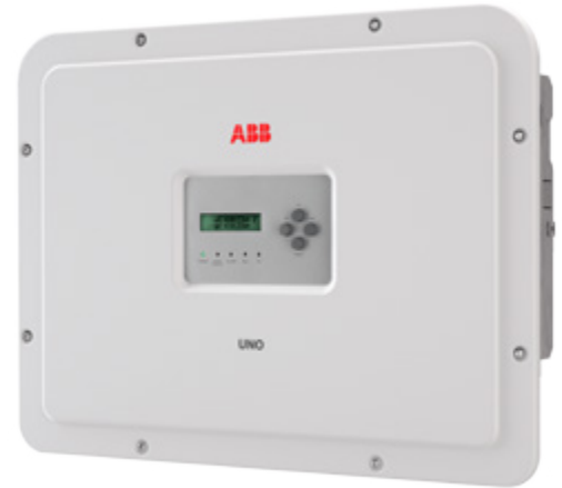
ABB string inverters UNO-DM-6.0-TL-PLUS 6 kW